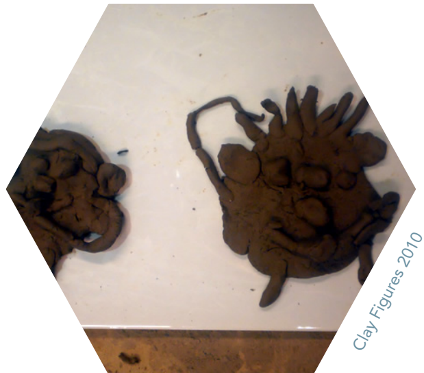
Clay Figures 2010